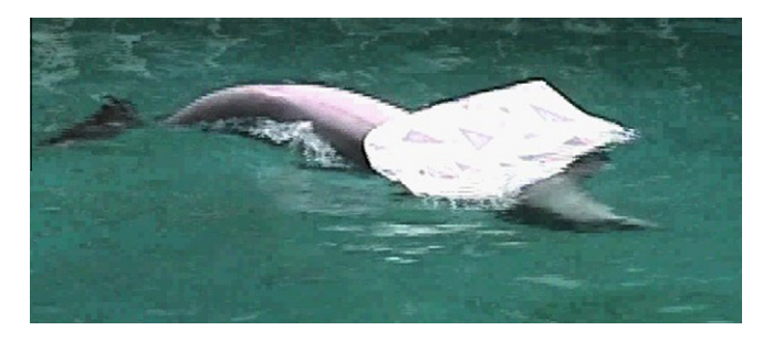
Fig. 3. Video frame from video sequence of the female dolphin Elele in the body-parts paradigm responding to the three-item gestural instruction, Surfboard + genitals + toss . She must swim from her instruction station, find the surfboard, turn on her back underneath it, and then toss the surfboard with an upward thrust of her genital area. Multiple objects are present in the pool. Dolphin instructor: Elia Herman.

use a body part in a specific way (e.g., "wash your hands," or "wash your face"). Among animals, language-tutored chimpanzees have been taught gestural names for several body parts in some cases, but there appears to be no systematic study of their understanding of those parts referentially in a manner similar to that used with the dolphin Elele. Thus, of a corpus of over 600 verbal instructions given to the bonobo Kanzi, only about 10 included a body-part reference (Savage-Rumbaugh et al., 1993). Of those few, the references were usually to the body parts of others (e.g., "brush the doggie's teeth") and were generally context-limited or accompanied by prompting. Similarly, Terrace (1979) listed only five body-part names within the chimpanzee Nim's receptive vocabulary of 200 items, but provided no data on the level or kind of understanding achieved. The gorilla Koko (Patterson & Cohen, 1994) reportedly could respond to the spoken words "eye," "head," or "nipple" by touching that body part or by giving the gestural symbol for that part, but no formal tests of understanding were given. This is not to say that apes might not be capable of understanding body parts referentially or of using them in novel ways when instructed, but that it has not yet been demonstrated.