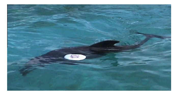
Fig. 2. Video frame from video sequence of the female dolphin Elele in the body-parts paradigm responding to the three-item gestural instruction, Frisbee + dorsal fin +touch . In response, Elele must swim from her instruction station, find the Frisbee, and then lay her dorsal fin on top of it. Multiple objects are present in the pool. Dolphin instructor: Elia Herman.

Comparatively, children as young as two can point to as many as 20 different body parts on a doll (MacWhinney, Cermak, & Fisher, 1987) or on themselves (Witt, Cermak, & Coster, 1990) in "show me" games, and can follow verbal instructions to